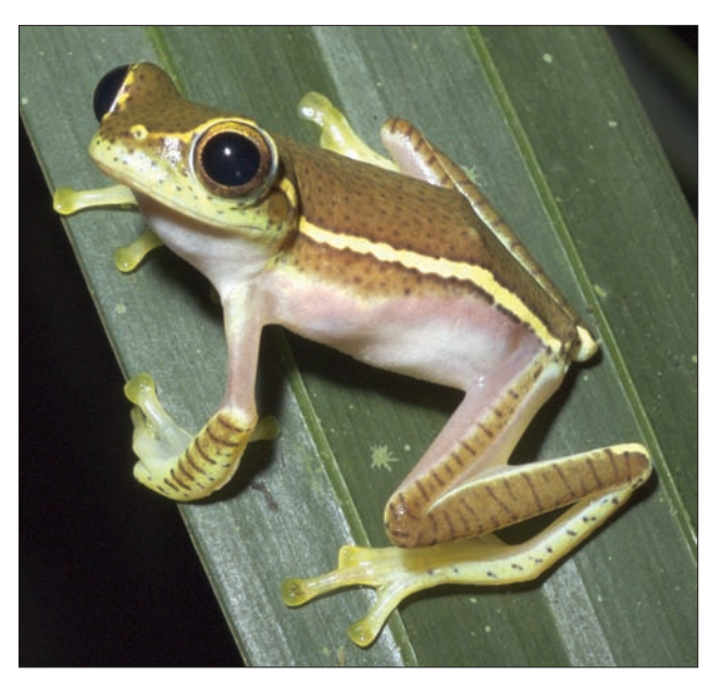
Fig. 1 A tree frog ( Rhacophorus lateralis ) from India.

The sequence of early divergences in Anura has been the subject of major controversy. Most of the debate focused on the phylogenetic position of archaeobatrachian families (taxa with primitive or transitional characters, covering ~4% of all extant species) with respect to neobatrachian families ("advanced" taxa, covering