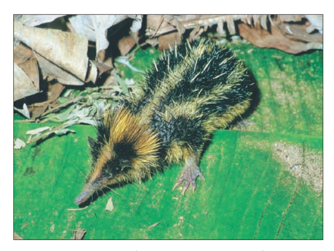
Fig. 1 A Streaked Tenrec ( Hemicentetes semispinosus ), Family Tenrecidae, from Ranomafana, Madagascar.

The Order Lipotyphla has been completely reorganized with the advent of molecular phylogenies. It is divided into two widely divergent clades, the Eulipotyphla as a