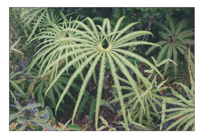
Fig. 1 A leptosporangiate fern ( Matonia pectinata R. Br.) from Malaysia.

The best-known and largest lineage of ferns is the leptosporangiates (Fig. 1), a monophyletic group of